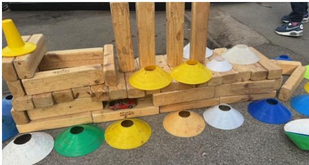
The Titanic – Made by Fangwei

We are also on the look out for any old hoovers that you may have at home, we currently only have 1 and it is one of the most popular items outside! If you do have an old Hoover that is useable to play with please could you bring them to the school office 😊